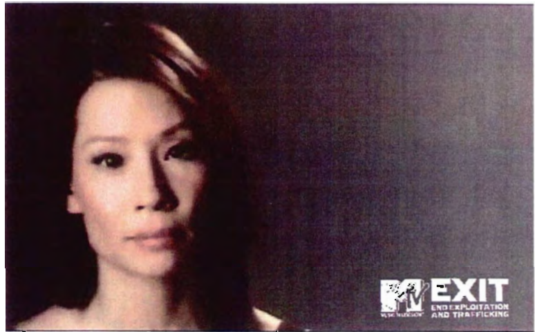
Lucy Liu, an internationally renowned American actress with both film and television credits to her name, hosts the USAID/MTV documentary special “Traffic.” The MTV program is a part of the EXIT campaign, targeted at the South- and Southeast-Asia regions, seeks to educate youth about the dangers and societal costs of human trafficking.

approach might be to demonstrate results that show ingenuity, thoughtfulness and good stewardship of government resources. This would serve to highlight USAID and foreign assistance in a positive light. Emphasis should be put on activities that have a measurable impact and make an appreciable difference in the lives of real people.