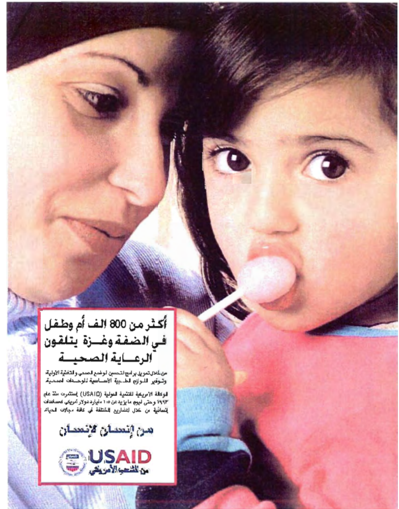
Display ad used in the 2005 Web Bank and Gaza media campaign. The USAID West Bank and Gaza mission has one of the most extensive track records of utilizing paid-media to increase awareness of recipient populations. This ad highlights USAID's work in health clinics.

➔ All of the successful campaigns mentioned have utilized an approach which has an emotional impact, thereby humanizing the work undertaken by USAID. The images and voices have been those of assistance recipients, not USAID officials citing statistics and trying to explain work in technical terms.